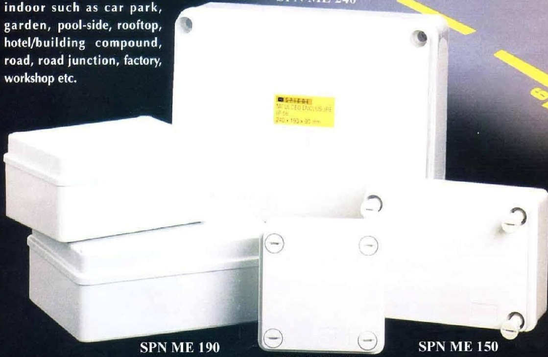
SPN ME 190